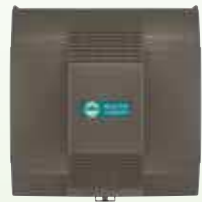
HCWP3-18 Power Humidifier 18 gallons per day

Equipped with a built-in fan, a Power Humidifier circulates humidified air. Since it works independently of your HVAC system, it can deliver humidity even when your system isn't running.