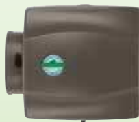
HCWB3-12 Bypass Humidifier 12 gallons per day