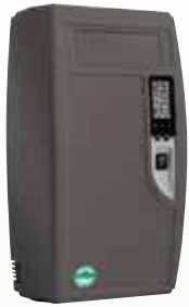
HCSteam-16 Steam Humidifier 16 gallons per day