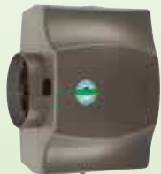
HCWB3-17 Bypass Humidifier 17 gallons per day

Bypass Humidifiers work in conjunction with your HVAC system, using the air handler or furnace fan to direct humidified air throughout the home.